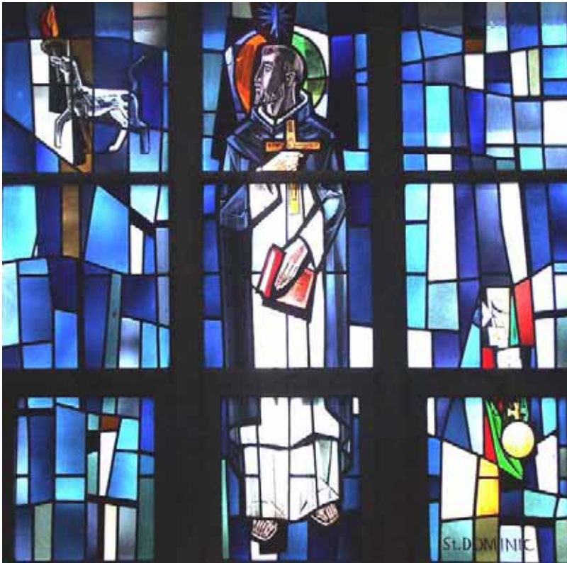
Depiction of Saint Dominic in window of Founders Chapel in Guzman Hall, Mount Saint Mary College