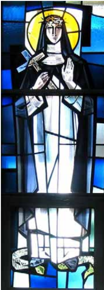
Saint Catherine of Siena (1347—1380)