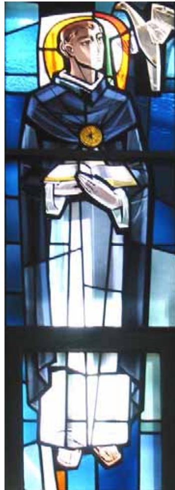
Saint Thomas Aquinas (1225—1274)

These windows appear in Founders Chapel, Guzman Hall. Saint Catherine was chosen because she is the patroness of our chapter and St. Thomas because of his patronage of educators and the namesake to the college's first academic building